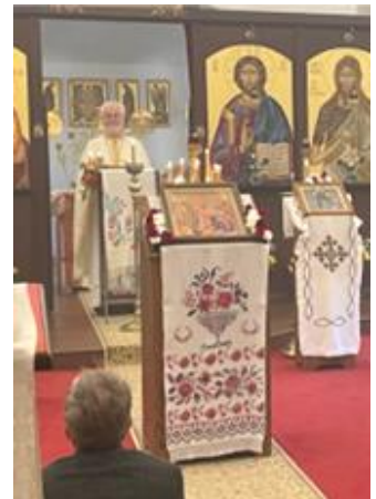
Above: Holy Friday tomb Middle: Procession at Pascha Far Right: Paschal homily