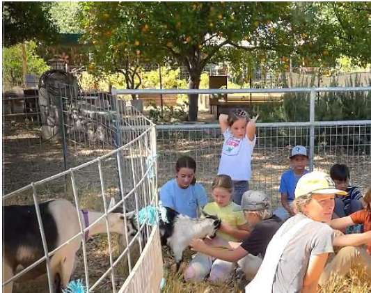
Baby goat receives pets and scratches while mama keeps a close eye.

guide, accompanied by Francis, the farm guard dog, led everyone through an engaging adventure of exploration and education. We learned about various interrelated aspects of God’s creation and our human stewardship of His gifts of flora, fauna, soil, air and water. (Did you know that animals can sense a nearby human’s heartbeat?) Racing to the tractor, picking and eating fresh tangelos from a giant tangelo tree (not to mention scaling its inviting branches), interacting with curious and friendly baby goats and petting a slightly reluctant chicken stand out as highlights from this 1.5-hour tour.