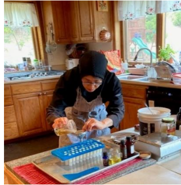
Left: Harvesting calendula and lavender. Above: Making lavender & calendula lip balm.