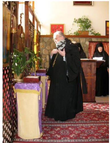
His Grace on a previous visit