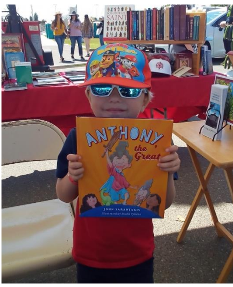
Top Left: Ventura Greek Festival booth Top Right: Happy little customer Left: Mama hen raising 18 peepers Bottom Left: Teens listen attentively Bottom Right: Let the little children come!